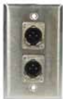
WP-203F 2 Mic