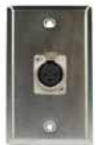
WP-103F 1 Mic

The bottom of the box has a 2" x 2-1/4" cut out with holes spaced at 3-1/4" inches. This allows you to mount any standard wall plate. Some examples are shown below.